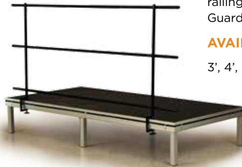
Stages and Seated Risers

Provide simple access for 16" stage heights.